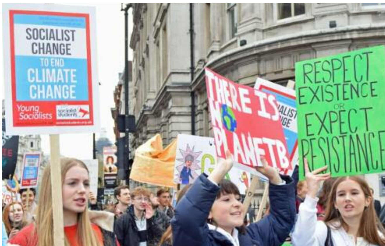
School students have been striking since February to defend the planet against climate catastrophe