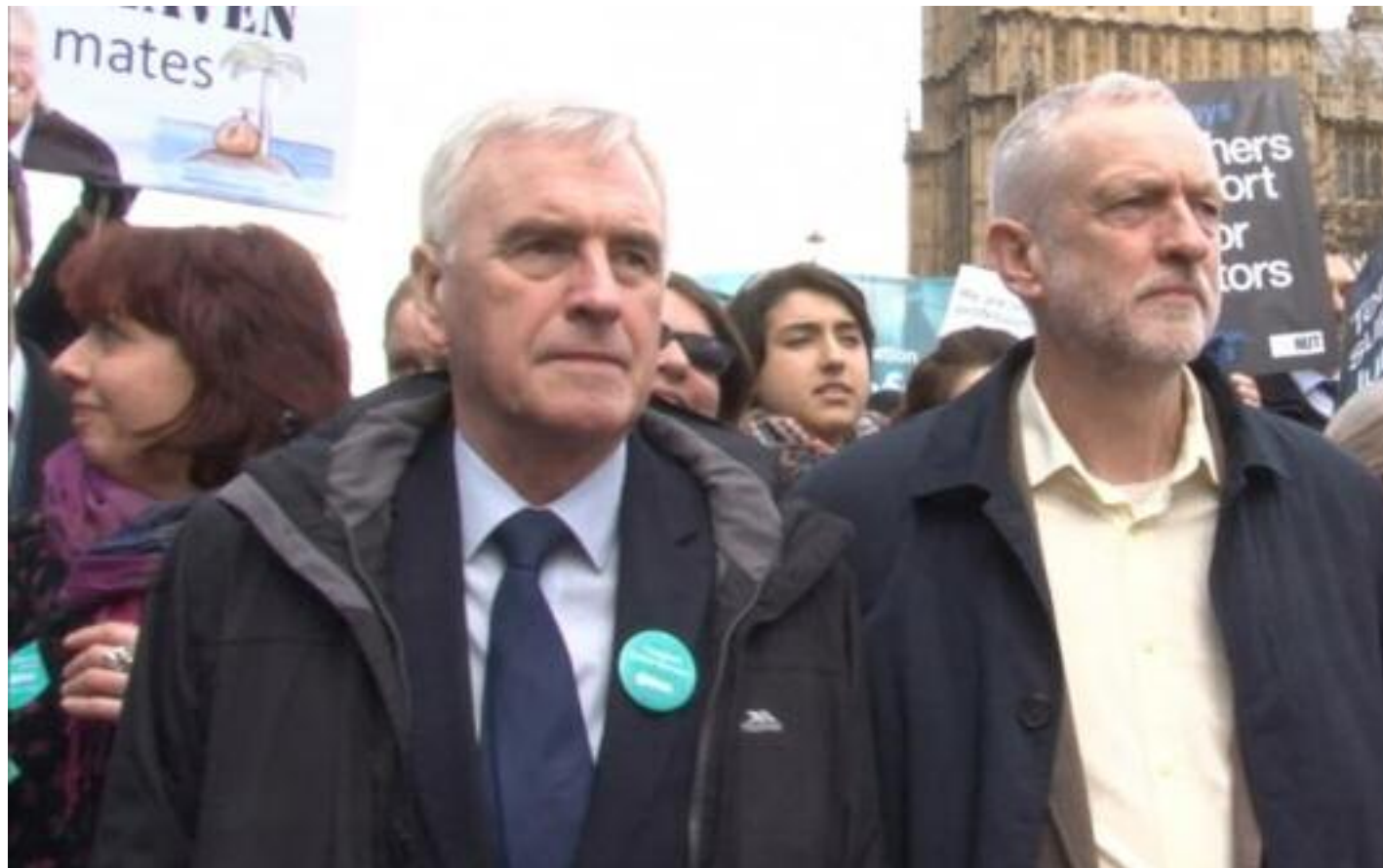
Corbyn and McDonnell must allow Labour members to remove the Blairites from the Labour Party and fight an election on a clear socialist platform

Such a government would be a tool to attack the working class. But it would also run the risk of the capitalists running out of alternative options and fuelling support for the left