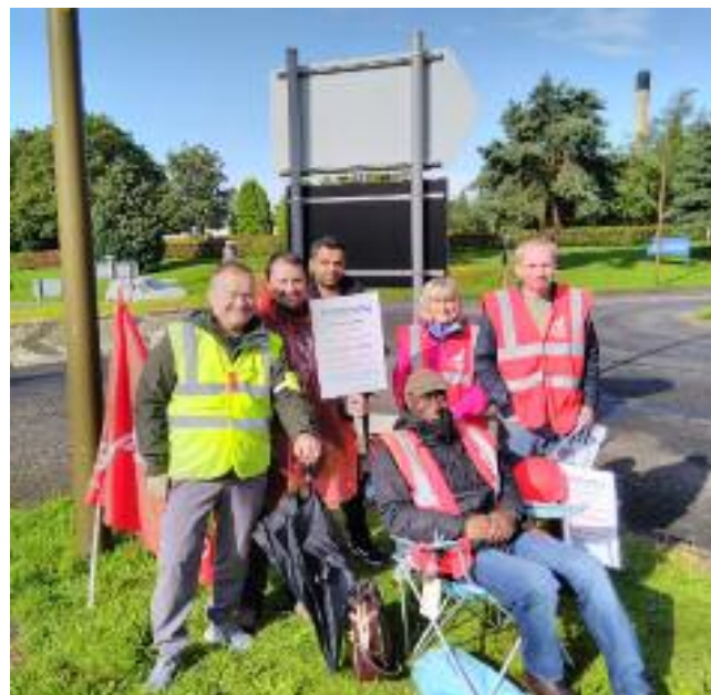
Unite picket line at Ninewells hospital, Dundee