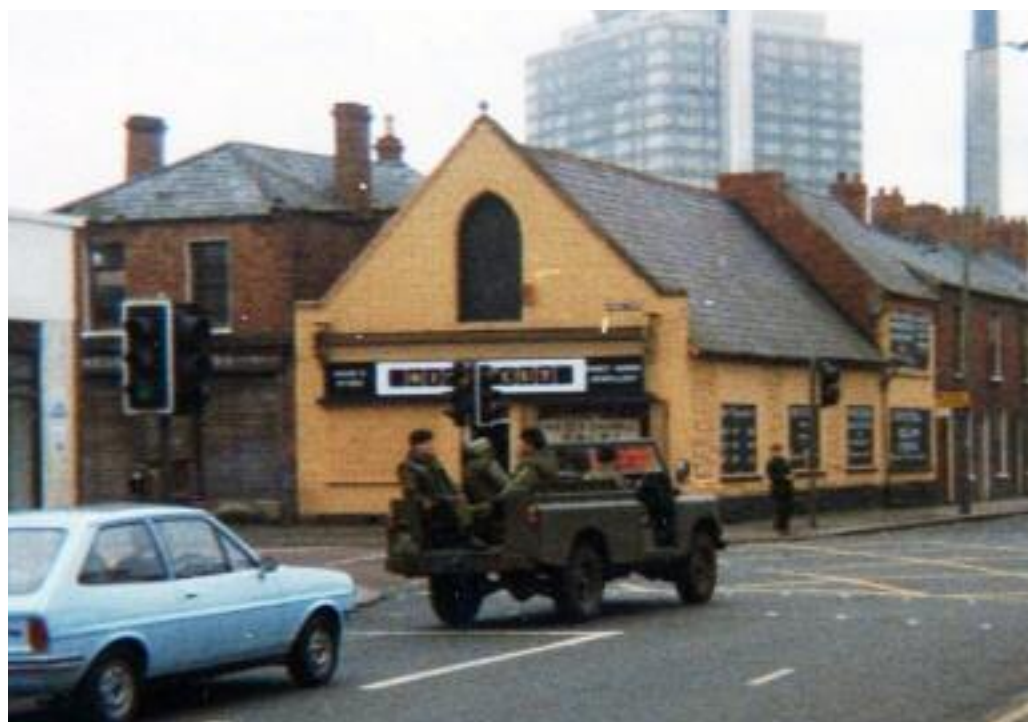
British troops stayed in Northern Ireland for decades after 1969