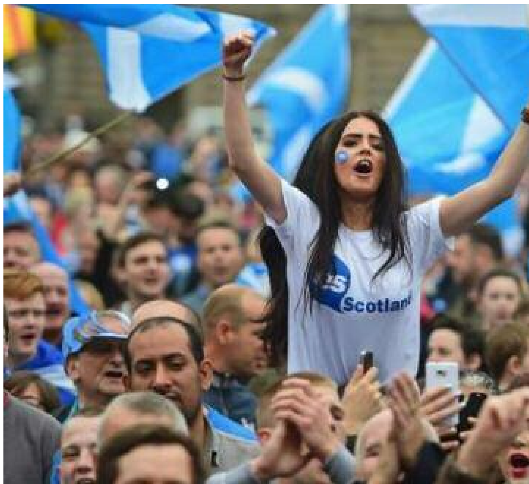
Above: The independence referendum was a working class uprising against austerity. Opposite: The front part of the crowd at a Scottish independence rally.

Indeed the 2017 Labour manifesto said the same thing. Which was to double-down on Labour's abysmal collaboration with the Tories and big