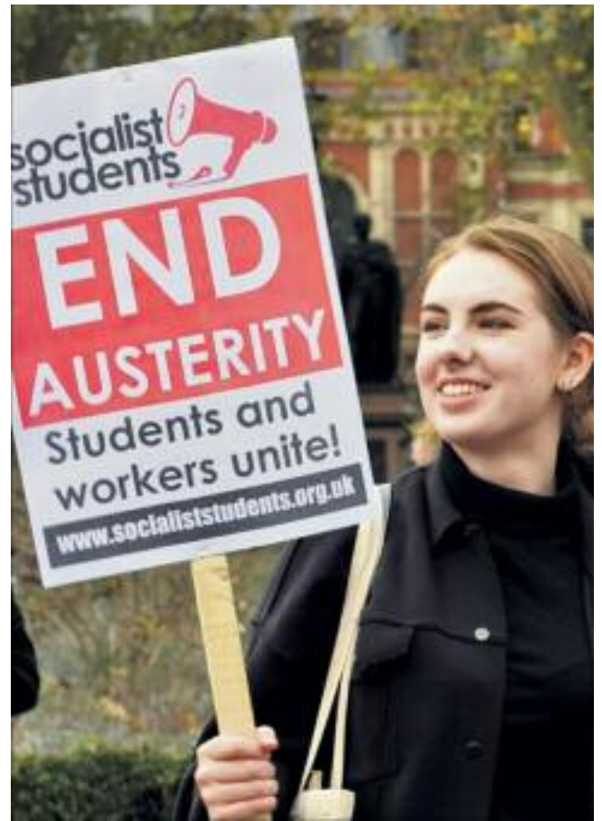
Socialist Students campaigns to end cuts and to build a mass student movement that links up with the trade unions to fight for socialist policies.

Where education is democratically run by teaching staff and students to lift people out of poverty and transform society from a profit-driven circus for the 1% to a socialist society that meets the needs of all workers and young people.