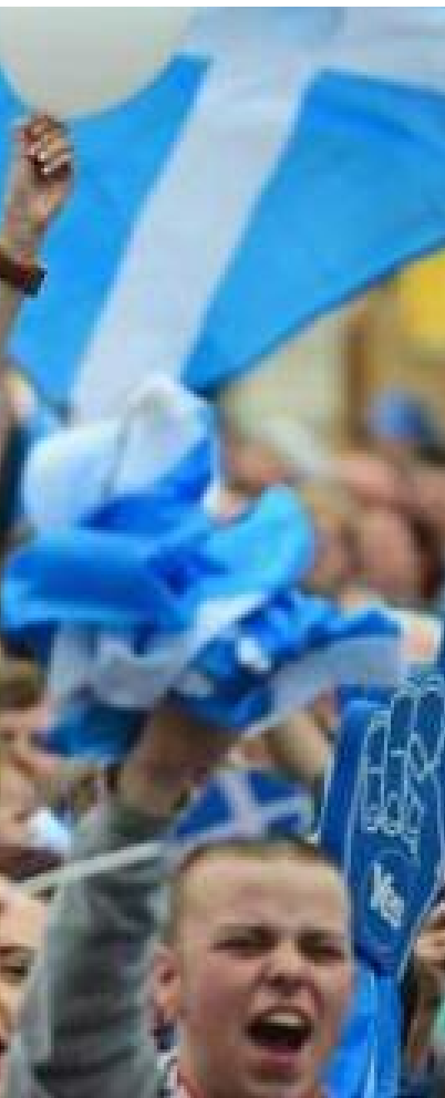
ge of the Socialist in September 2014

wage for all. As it is Tom Watson, Ian Murray and other leading Blairites have used McDonnell's pledge to ratchet up the civil war against Corbyn. A further split away by a section of the Blairites prior to a general election is possible.