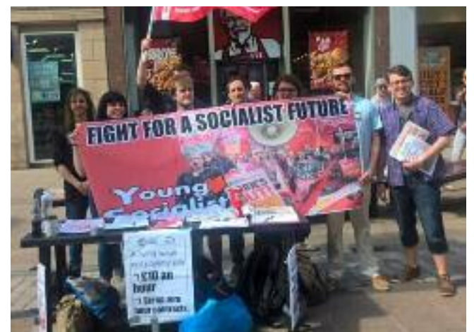
Campaigning in Dundee

This relationship between boss and worker creates a tension in the workplace which expresses itself through class struggle.