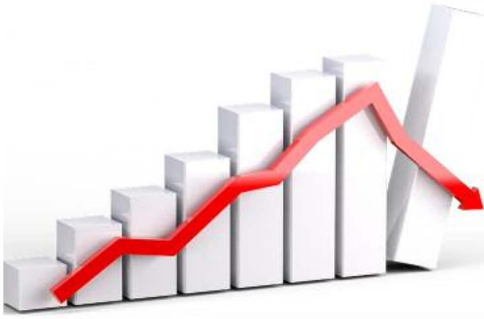
Recessionary fears are stalking the world economy