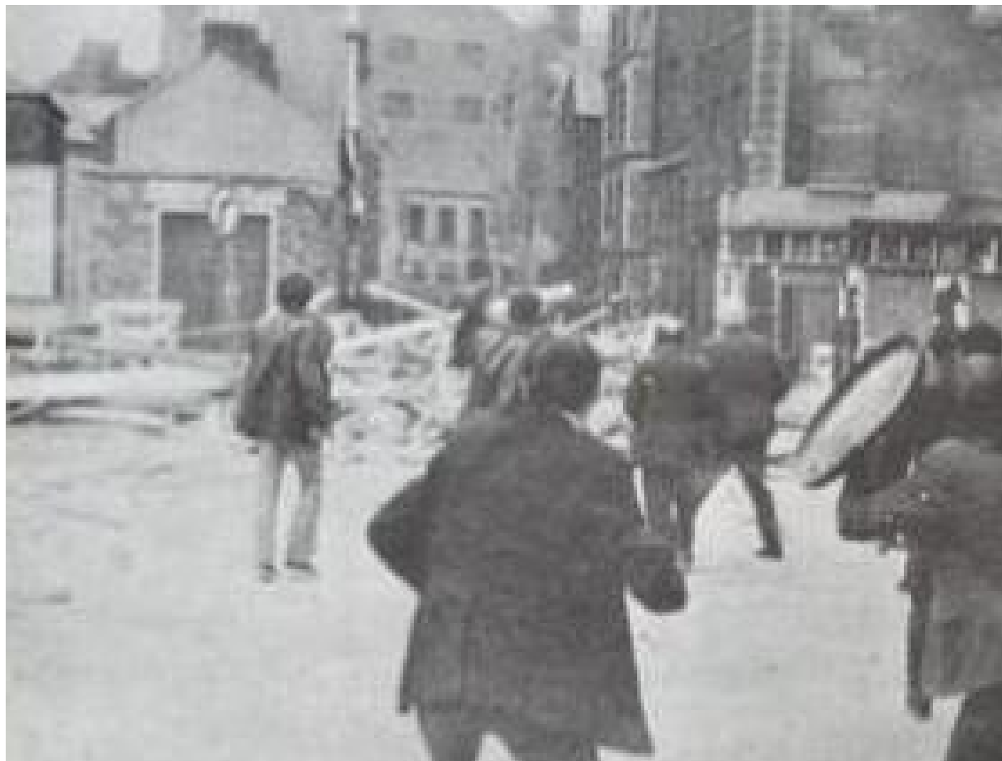
Local residents in the Bogside, Derry defended their communities against police and Loyalist attacks

Left and socialist ideas were strong in the Derry Labour Party and Young Socialists. They not only opposed Unionist misrule, but also the conservative Nationalist Party that had failed to win any meaningful reforms for mistreated Catholics.