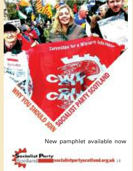
New pamphlet available now

No to the return of tuition fees in Scotland. Cancel the student debt and end the cuts in education funding.