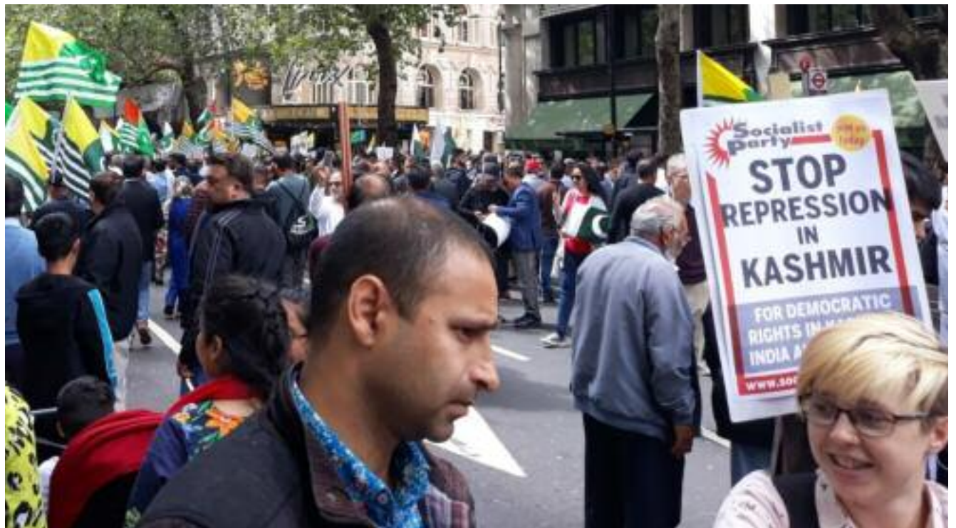
Solidarity with Kashmir protest in London

However, none of these parties, including the Communist Party, has stood for the national rights of Kashmiris. Some of these parties are now using the situation to oppose BJP rule as nationalist tensions in many states, particu-